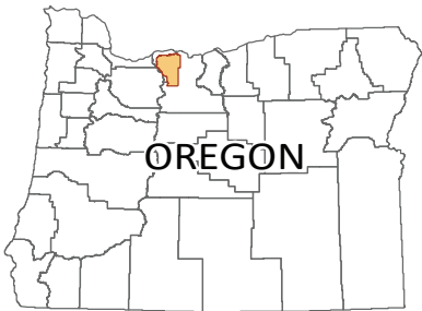
Study Location Map

This map is an overview map and not intended to provide details at the community scale. The GIS data that is published with the Hood River County Natural Hazard Risk Assessment can be used to inform regarding queries at the community scale.